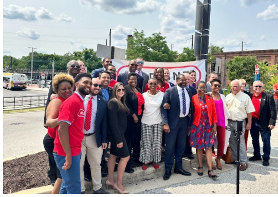
Baltimore City and Baltimore County State Delegations showing regional pride at the MDOT Red Line Relaunch Announcement