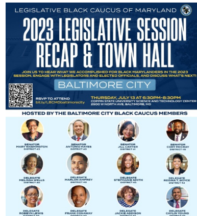
Baltimore City Delegation - LBC of Maryland Town Hall, Coppin State University