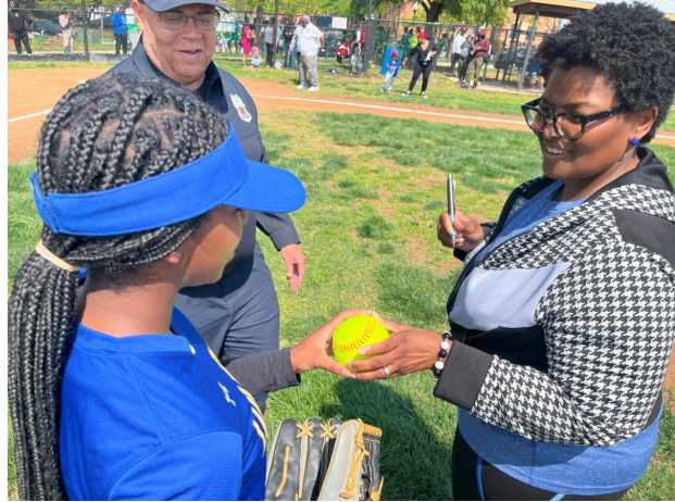
Senator Washington signing first Pitch Ball on Opening Day