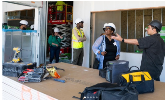
Wide Angle Youth Media's Design Team