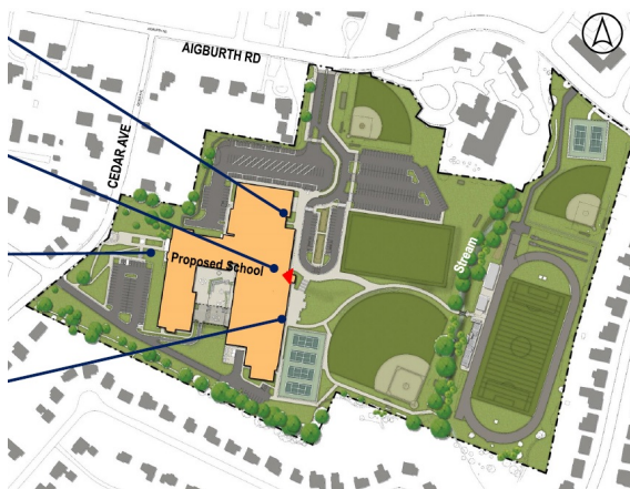
Towson High School Site Plan – Building Entrances