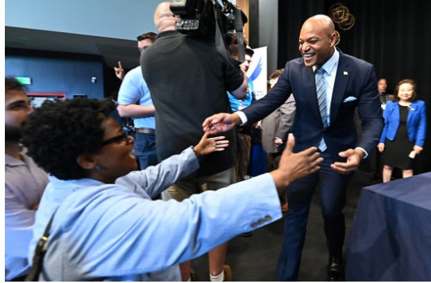
Senator Washington greeting the Governor at Executive Order Signing at the Henderson Hopkins Elementary School