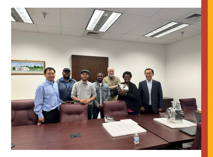
Senator Washington and members of Morgan State University's CAESECT Lab